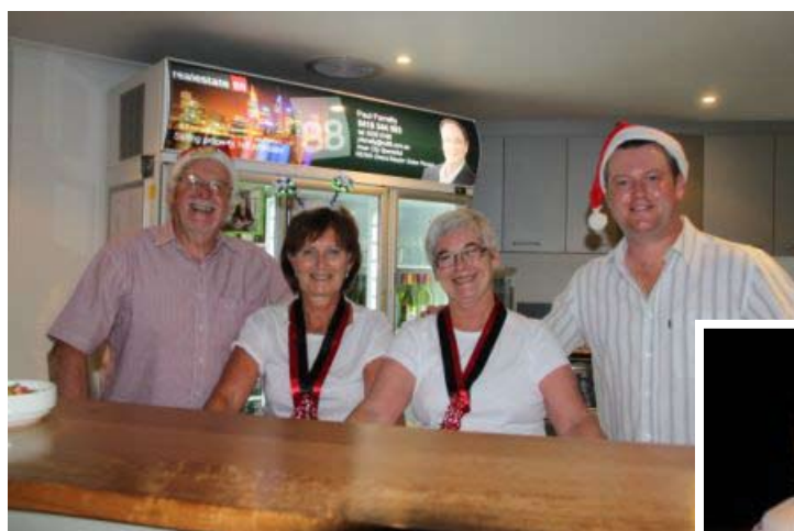
Club members enjoying the Christmas Party in 2010.