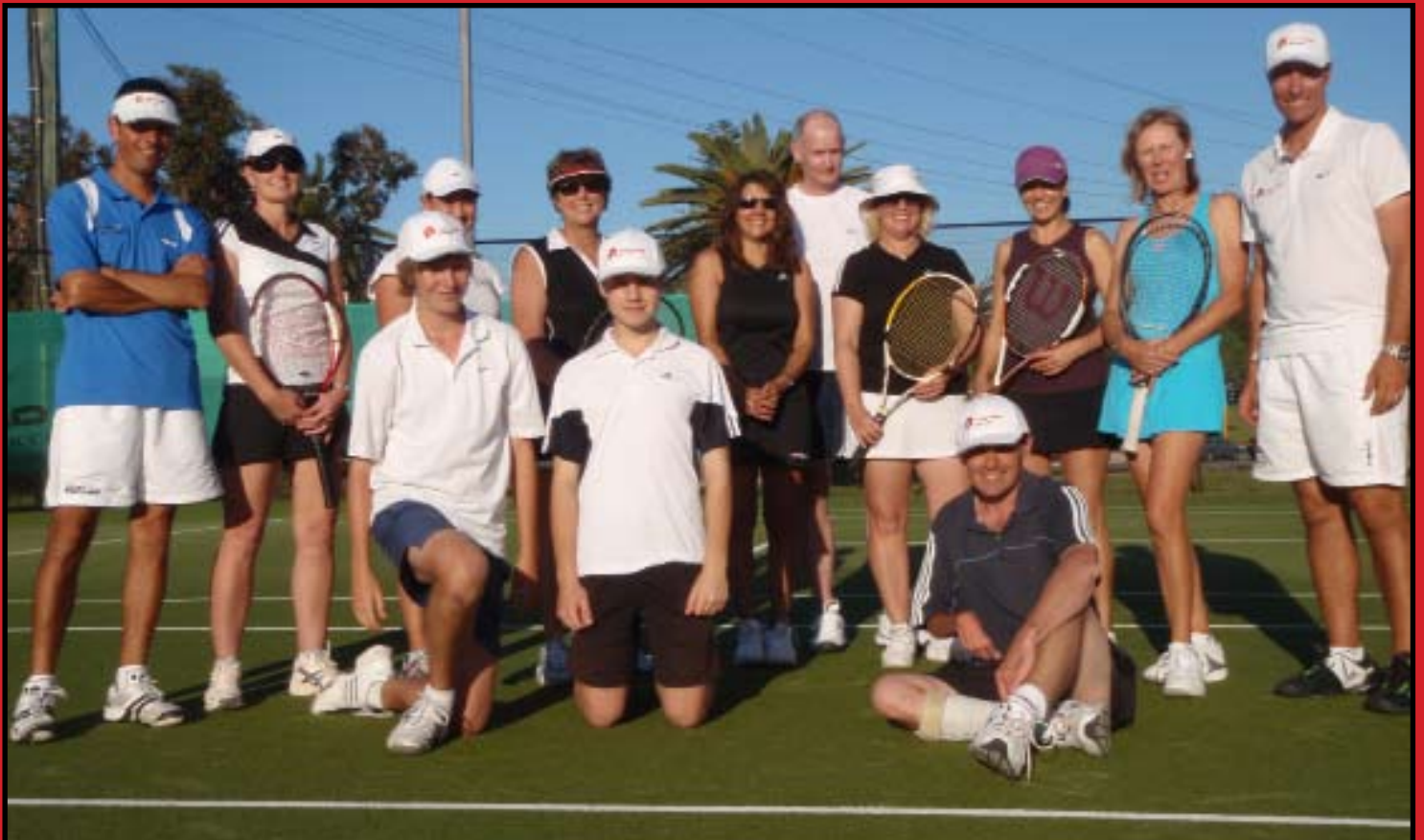
Adult Day Camp at Floreat Park Tennis Club, 9th Oct 2011